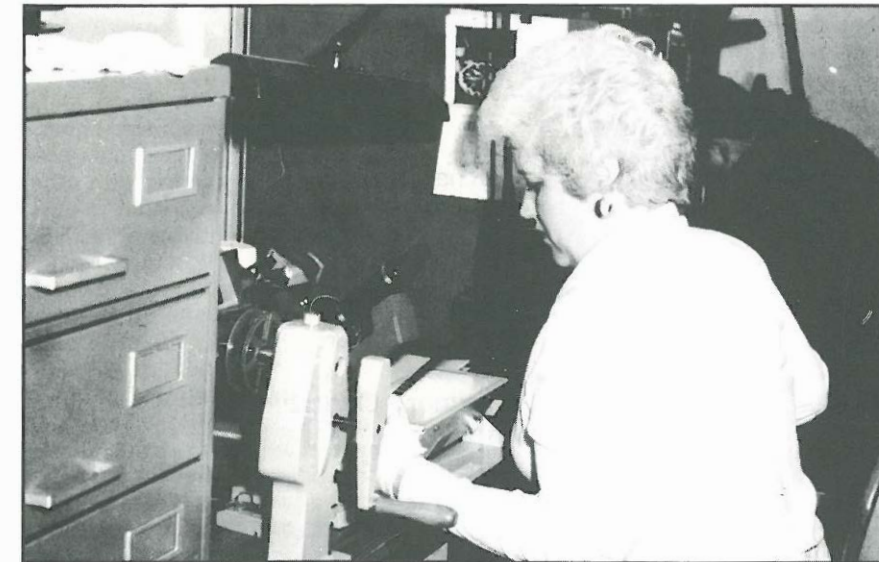
All of the historical documents at the Simpson Historical Research Center have been microfilmed, with duplicate films deposited at the National Archives and the Office of Air Force History. Here, a technician reviews film for flaws.